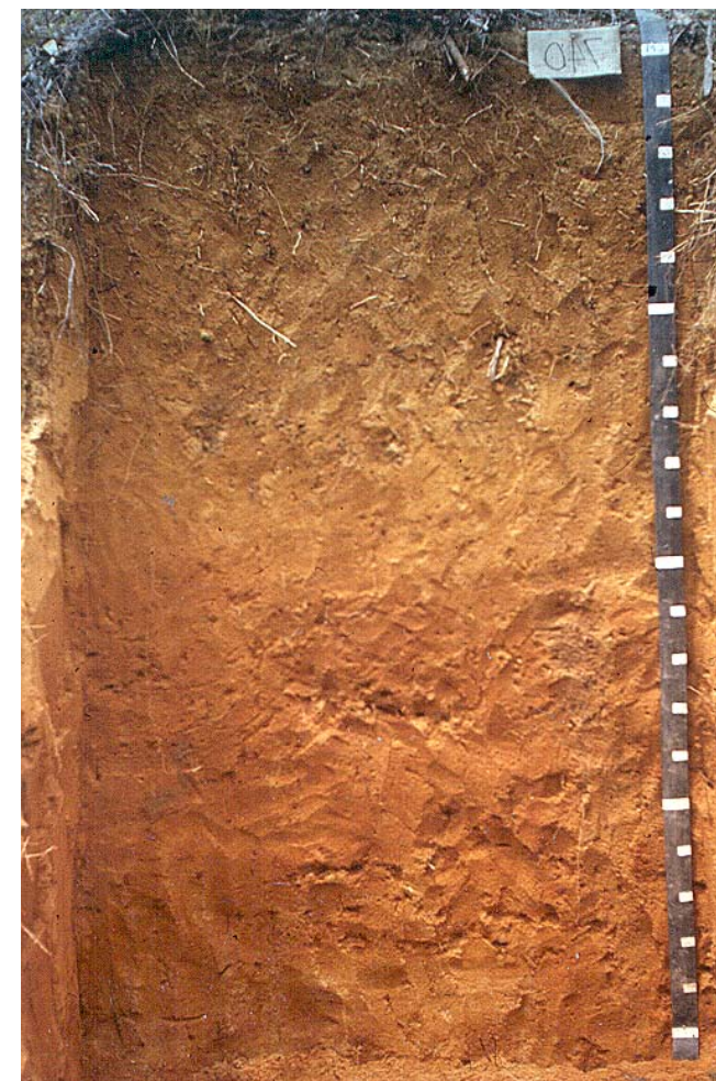
Fragic, subnatric, Aeric Podsol/Tenosol

Location Newling Landform Hills Geology Palaeogene Pebble Point Formation Element Mid slope Slope 37% Aspect North-easterly