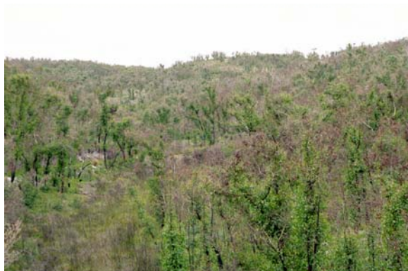
Fire scarred landscape near Newling

Location Newling Landform Hills Geology Palaeogene Pebble Point Formation Element Mid slope Slope 37% Aspect North-easterly