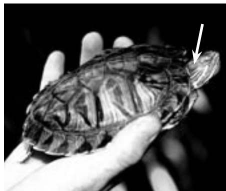
Red eared slider turtle in hand. Arrow indicates red stripe behind eye. (Photo: DNRME Qld).