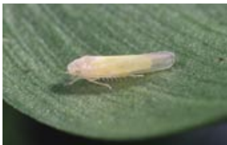
Bridal creeper leafhopper.

B ridal creeper ( Asparagus asparagoides ) is a Weed of National Significance which causes extensive damage to conservation reserves. It was introduced into Australia in 1857 as a decorative plant and became a regular feature of bridal bouquets. A leafhopper ( Zygina sp.) was released in Australia in 1999 as a biological control agent.