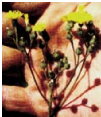
King devil hawkweed – a new weed for Australia has been found at Falls Creek.