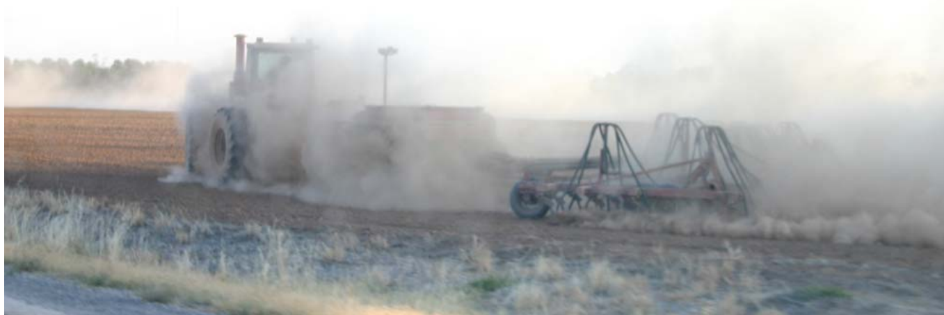
Grain growers in the north have commenced dry sowing. (April 2008).