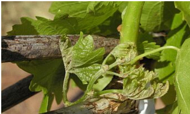
Figure 2. A young flag shoot showing typical cupped leaves.

In most Australian districts, flag shoots are the main source of primary inoculum. Flag shoots emerge during budburst and soon begin to produce conidia. The conidia are blown onto leaves or other green vine tissue, and germinate to start new infections in five to ten days. Wet conditions are not required for the germination of conidia.