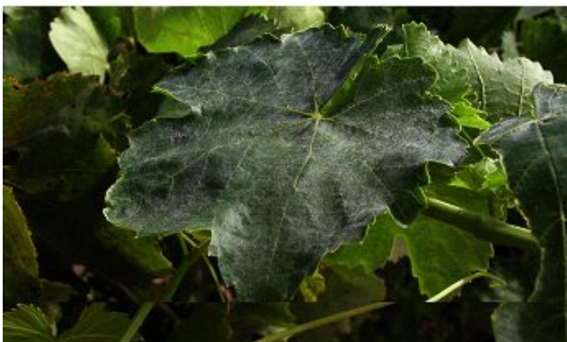
Figure 1. A grape leaf covered with powdery mildew.

Grapevine powdery mildew, also called oidium, is caused by the fungus Uncinula necator . This fungus infects green grapevine tissue including leaves, stems and berries. As the fungus grows, and especially when it produces spores, it gives infected tissue an ash grey powdery appearance.