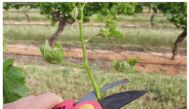
Figure 6. Early removal of flag shoots can help reduce powdery mildew infection levels.

Because powdery mildew infections begin from flag shoots or cleistothecia that have overwintered on the grapevine, the removal or destruction of prunings will not have any useful impact on powdery mildew.