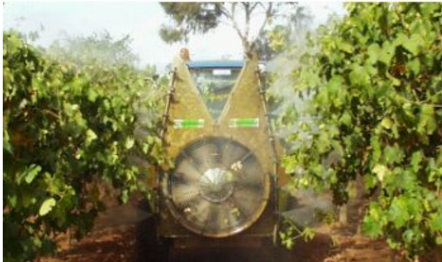
Figure 8. Thorough spray coverage is critical for good powdery mildew control.

To achieve effective coverage, machinery calibration and set-up must be correct. It is particularly important to adjust spray volumes to suit the canopy volume, which varies markedly during the season. Growers can be assisted in equipment set-up by the equipment suppliers or training programs such as the 'Research to Practice Spray Application in Viticulture' workshops organised by the Cooperative Research Centre for Viticulture (see 'Additional information sources').