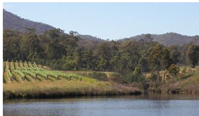
Figure 4. Research results indicate that higher humidity levels near water bodies increase the risk of powdery mildew infection.

Soil type – The need for supplementary irrigation on vines in higher rainfall areas depends in part on soil type. Light, shallow soils are more likely to require irrigation. Irrigation may then increase disease risk by increasing vineyard humidity levels (if applied by undervine sprinklers - see below).