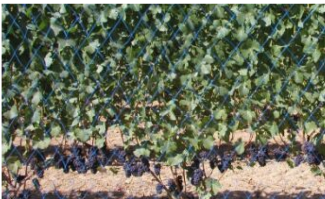
Figure 5. The disease risk on these organic vines is reduced by the canopy structure that maximises air flow and opens the canopy to direct sunlight.

To achieve the above canopy management objectives, organic grape growers can use the common techniques of shoot positioning, foliage trimming and manual or mechanical removal of leaves from around bunches.