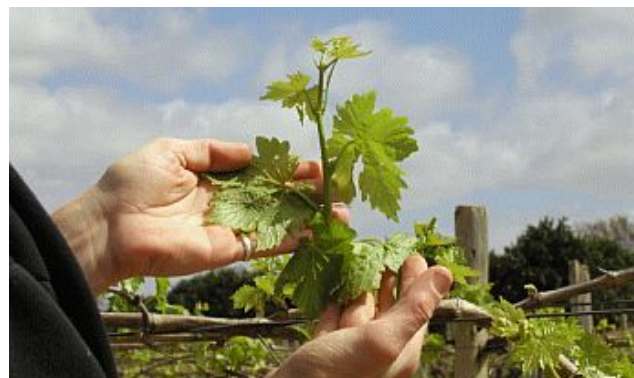
Figure 7. Vineyard monitoring is necessary to determine the extent of infection and effect of any treatments applied.

Early symptoms of infection are isolated, small, light green to yellow blotches on leaves. On the underside of the blotches, the leaf veinlets turn brown. Hyphal growth and spore production on the leaf surface make older infections look powdery. Flag shoots, with their distorted growth and powdery appearance, start to become obvious from the three-leaf growth stage (from two weeks after budburst).