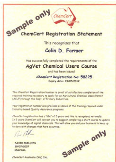
Figure 2. ChemCert Certificate

The ChemCert course is just one of the available chemical user training courses that form the pre-requisite training in safe chemical use that once completed, allows a person to apply for an ACUP.