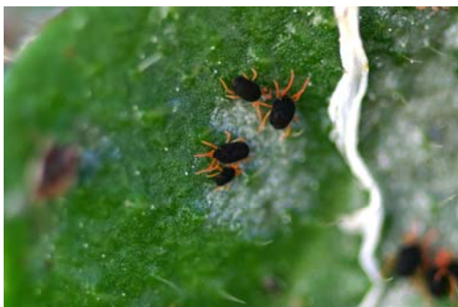
Figure 1: Redlegged earth mites (Halotydeus destructor).

Other mite pests, in particular blue oat mites and the balaustium mite, are sometimes confused with RLEM in the field. Blue oat mites can be distinguished from RLEM by an oval orange/reddish mark on their back, while the balaustium mite has short hairs covering its body and can grow to twice the adult size of RLEM. Unlike other species that tend to feed singularly, RLEM generally feed in large groups of up to 30 individuals.