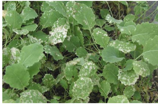
Figure 4: Redlegged earth mite feeding damage results in the appearance of white or silvery patches on plant foliage.

Typical mite damage appears as 'silvering' or 'whitening' of the attacked foliage. Mites use adapted mouthparts to lacerate the leaf tissue of plants and suck up the discharged sap. The resulting cell and cuticle damage promotes desiccation, retards photosynthesis and produces the characteristic silvering that is often mistaken as frost damage. RLEM are most damaging to newly establishing pastures and emerging crops, greatly reducing seedling survival and development. In severe cases, entire crops may need re-sowing following RLEM attack.