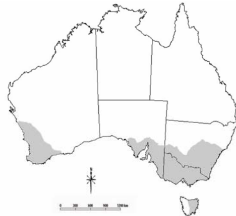
Figure 2: The distribution of the redlegged earth mite in Australia (shaded areas indicate known distribution).

Although individual adult RLEM only move short distances between plants in winter, recent surveys have shown an expansion of the range of RLEM in Australia over the last 30 years. Long range dispersal is thought to occur via the movement of eggs in soil adhering to livestock and farm machinery or through the transportation of plant material. Movement also occurs during summer when over-summering eggs are transported by wind.