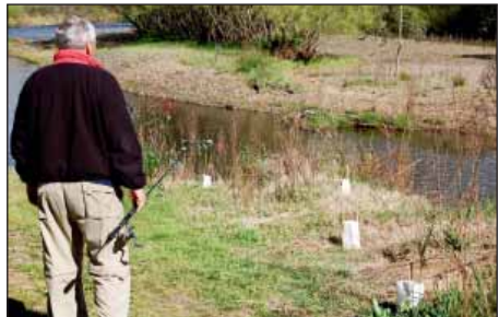
Establishing an Adopt-a-Stream program.