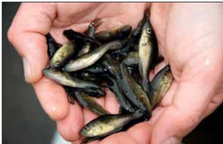
Constructing a new native fish production facility in northern Victoria.