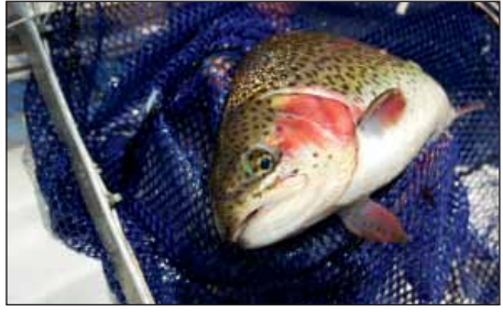
Boosting fish stocking by 30 percent.