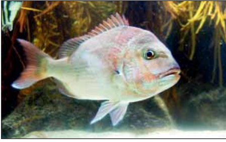
Trialling artificial reefs in Port Phillip Bay.