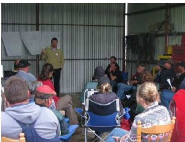
Dairy farmers gather for a 'Dairy Shed Session' in the Northern Irrigation Region in September.