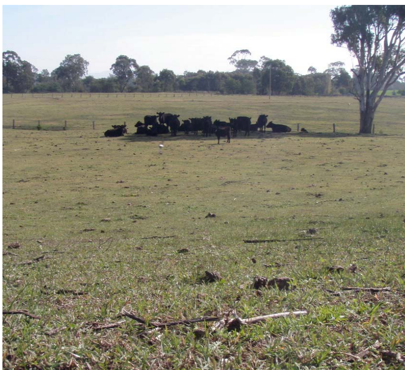
Kikuyu pastures around Maffra typically outperform other pastures, but currently are only just keeping pace with grazing. (May 2009).