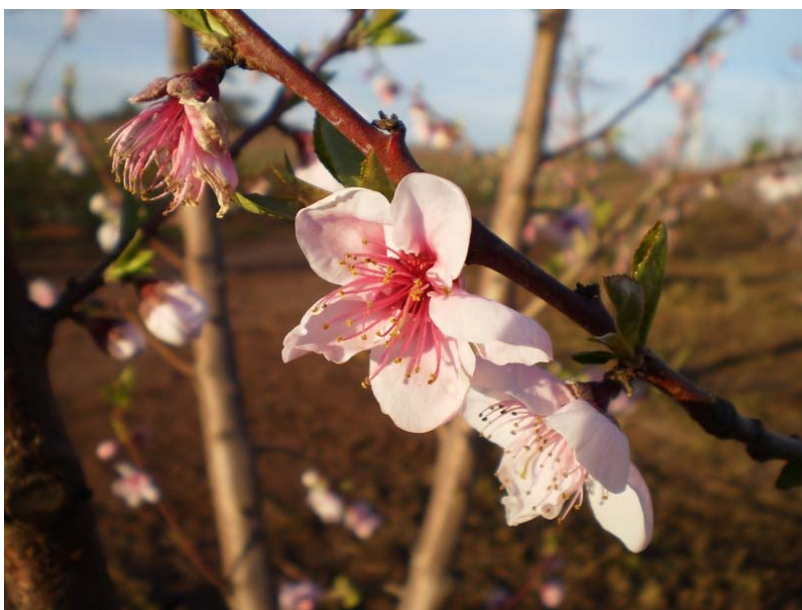
Stone fruit is beginning to flower at Swan Hill