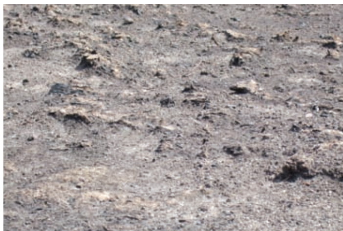
Very hot burn – no plant material visible, earth has a blackened, charred appearance.

Published by the Department of Primary Industries, 1 Spring Street, Melbourne, Victoria 3000 Australia April 2009