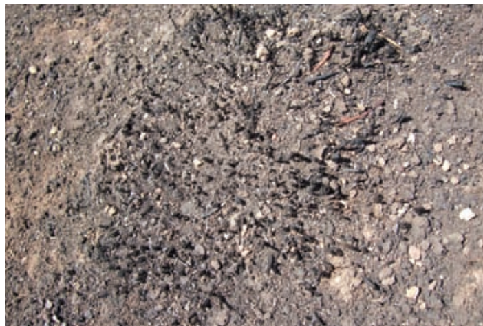
Close-up view of perennial plant effected by a hot burn. All dead material is burnt, perennial plant is blackened.