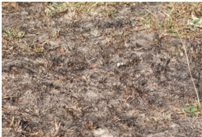
Cool-moderate burn – pasture is charred, but not completely blackened. Recent rains have initiated recovery of perennials.