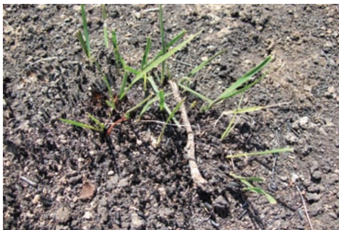
Perennial plant recovering from a hot burn.