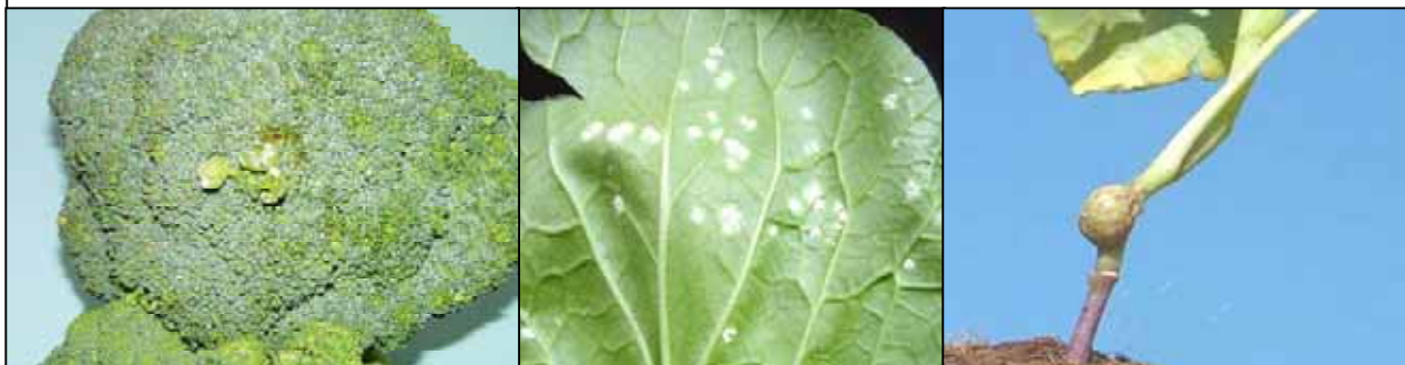
White blisters on flowers, leaves and gall on seedling stem

The disease white blister is caused by the pathogen Albugo candida . It affects many economically important brassica crops including broccoli, cauliflower, Brussels sprouts, rocket, radish and many common brassica weeds. Plants infected by A. candida show two types of symptoms: white pustules or 'blisters' of various sizes on leaves and heads of broccoli and cauliflower, and/or distortions and swellings of leaves, stems and heads.