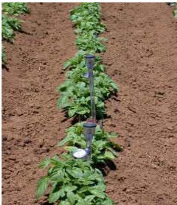
Tensiometers installed in a potato crop

The potato is a moisture sensitive crop with the majority of its roots confined to the top 30-40 cm of soil. This shallow root system makes it very sensitive to water stress and efficient and accurate irrigation is important for profitable production.